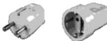
Schuko plug and socket